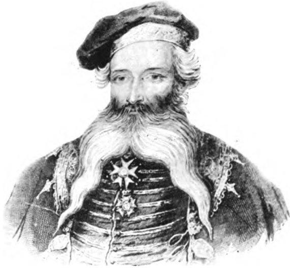
GENERAL ALLARD, ORGANISER OF THE SIKH CAVALRY.